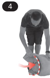
• Still pushing down, twist your right hand inwards and then follow with the left hand allowing the edges to overlap.