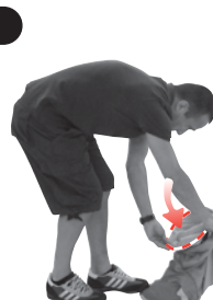
• Push in the over hanging coil and then fold down the remaining coil.