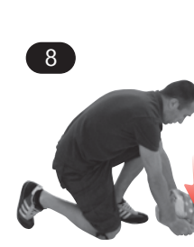
• Fold flat and replace into warning band.