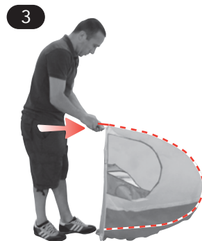
• Insert assembled rods