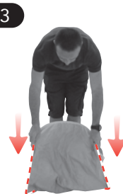
• Push downwards and let product curve outwards.