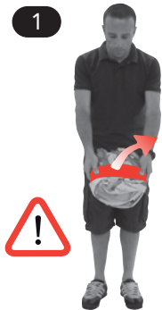
• Carefully open out.