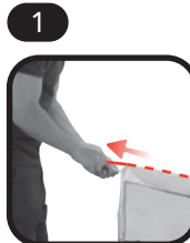
• Remove rods